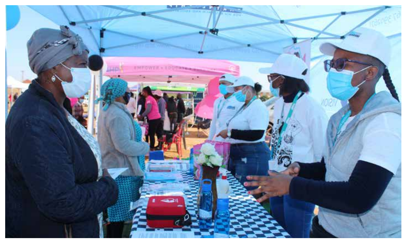
CoVPN 3008 Team engaging with visitors at the BHP Stall

Community Engagement is critical for building relationships between the researchers and various stakeholders involved in medical research. This entails community involvement in the research process from early stages of protocol development, to implementation, and dissemination of study results and their impact on public health.