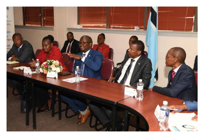
Acting Minister of Health, Sethomo Lelatisitswe addressing the meeting