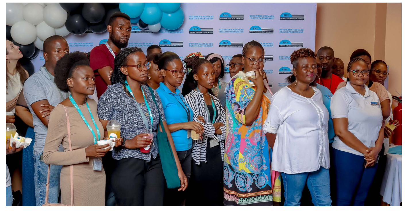
BHP Staff listening attentively to BHP Chief Executive Officer at the BHP new logo launch

The Botswana Harvard Health Partnership (BHP) on the 6th October 2023 launched its refreshed logo which reflects the change of company name from Botswana Harvard AIDS Institute Partnership (BHP). The new registered name; The Botswana Harvard Health Partnership change came into effect on the 1st November 2022. The acronym BHP will remain the same, therefore the organization still remains to be commonly referred to as BHP .