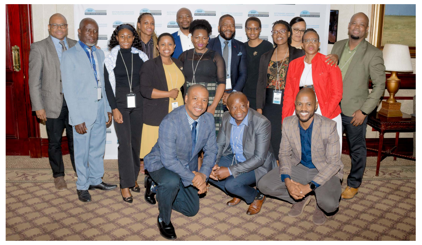
BHP CTU team