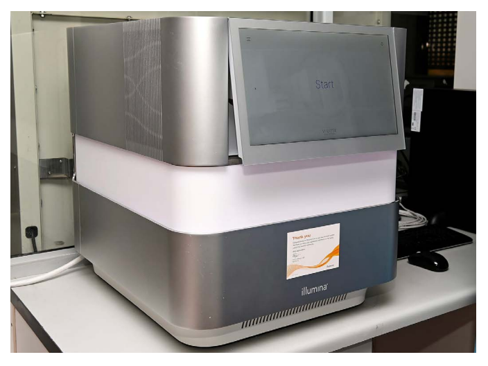
Illumina NextGen2000 sequencing machine

Receiving the gift, His Excellency Dr Mokgweetsi Keabetswe Eric Masisi expressed his gratitude to Africa CDC for responding to the needs of Botswana, promising Dr Kaseya that the lab will use the machine for the good of humanity, not only Batswana but all that traverse its borders as Botswana health system does not discriminate.